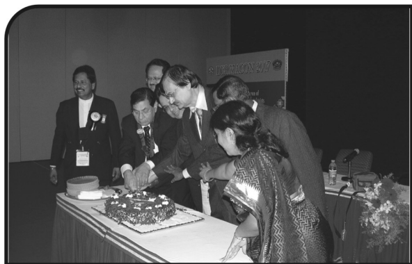
IADVL Day Celebration

For the first time in the history of IADVL, the birthday of IADVL was Celebrated on 28 January during DERMACON 2007 in Chennai.