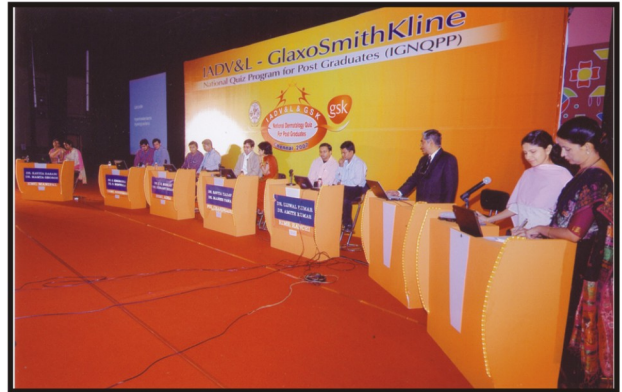
QUIZ Time !