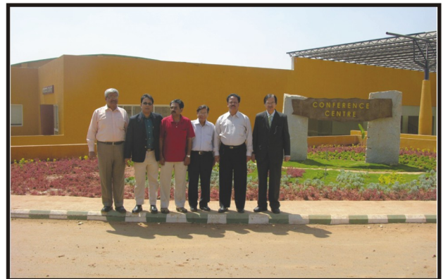
Venue Visit for DERMACON 2009, Bangalore