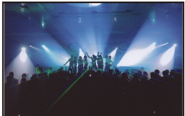
Dazzling DERMACON !