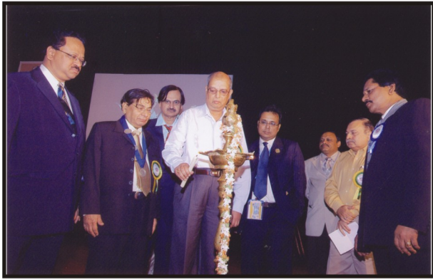
Inauguration of DERMACON 2007