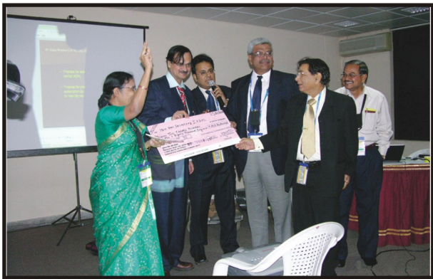
Triumph of DERMACON 2006