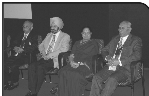
Teachers Par Excellence