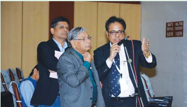
IADVL CC Meeting and Closing GBM 2015-2