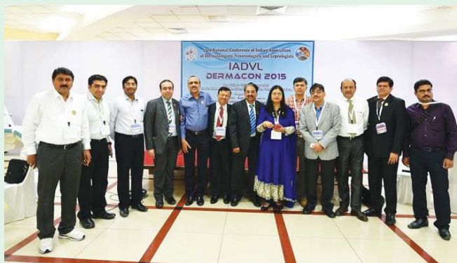
IADVL Practice Management Cell Meeting at DERMACON 2015