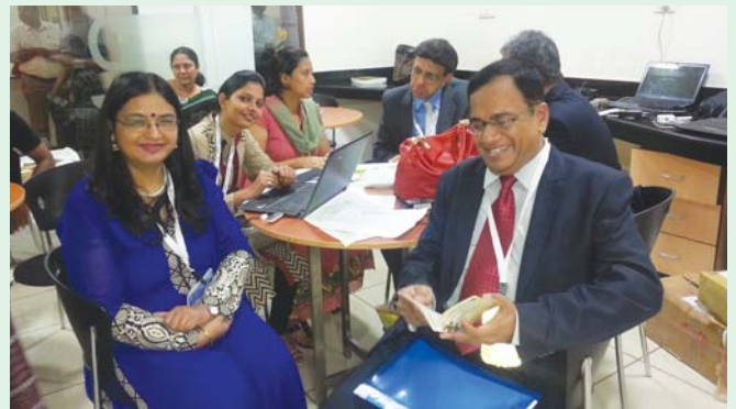
IADVL Stall DERMACON Mangalore 2015