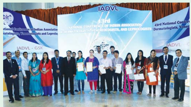
Winners of IADVL GSK National Quiz for PGs 2015 will IADVL EC and National Quiry Master