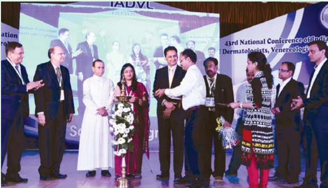
Inauguration of CME at DERMACON 2015