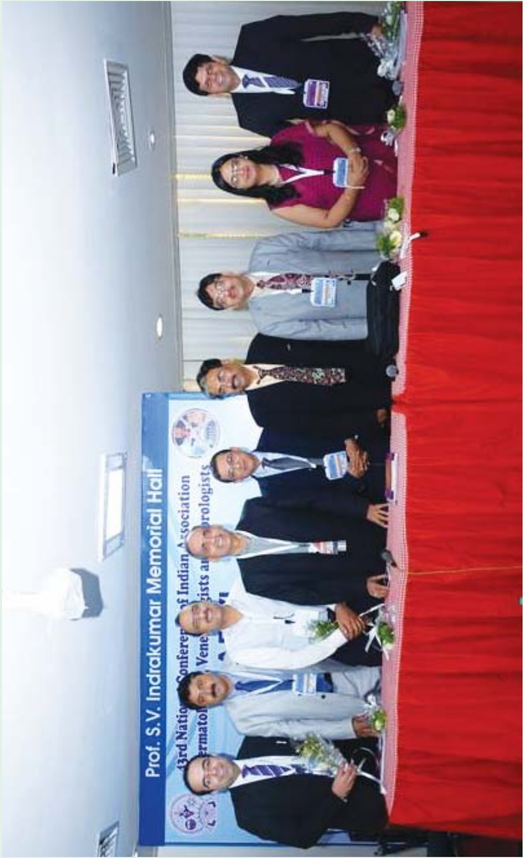
IADVL EC 2015