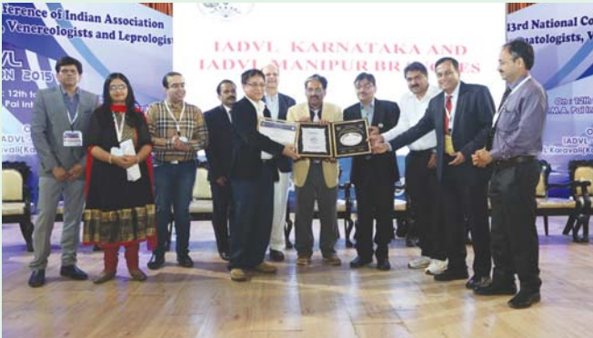
IADVL Best Branch Award 2014-Manipur