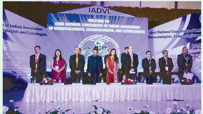
DERMACON 2015 Inauguration