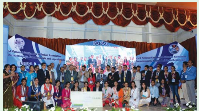
IADVL EC with DERMACON Mangalore Organising Team