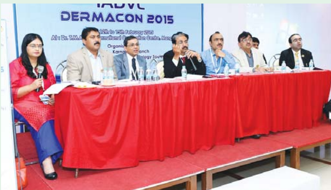
AGBM of Opening Year at DERMACON 2015