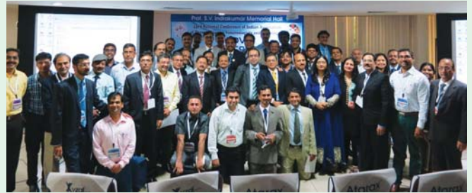
ACAD IADVL Session at DERMACON 2015