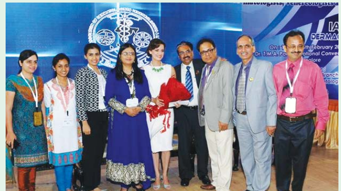
IADVL ITATSA Campaign in DERMACON 2015