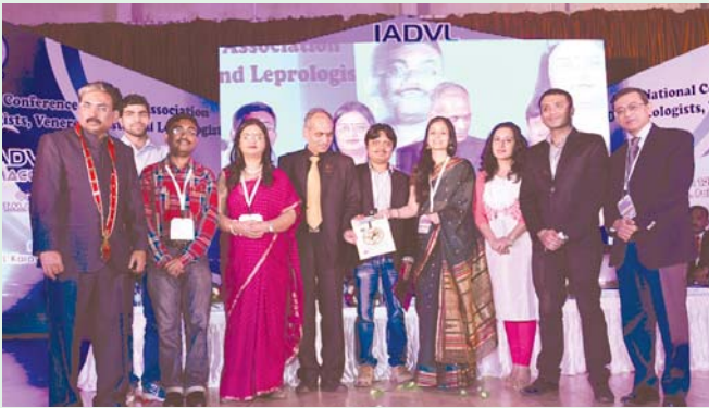
IADVLEC with Residents-Dream Editorial Team at Inauguration DERMACON 2015-1