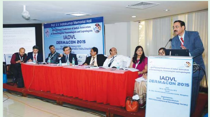
IADVL Combined CC Meeting and GBM Closing Year 2015