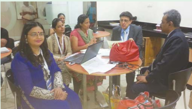
IADVL Stall DERMACON Mangalore 2015