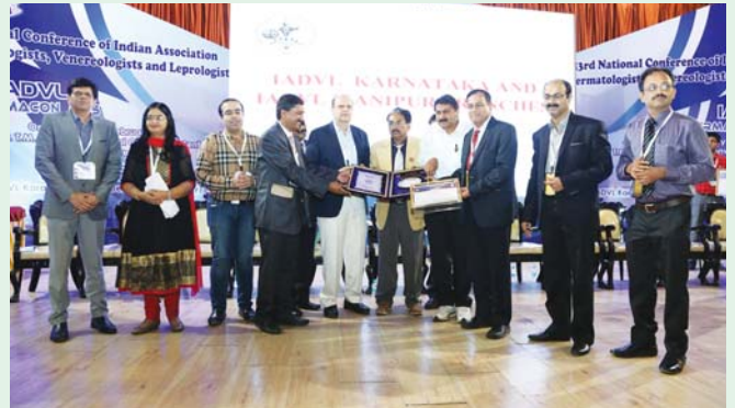
IADVL Best Branch Award 2014-Karnataka