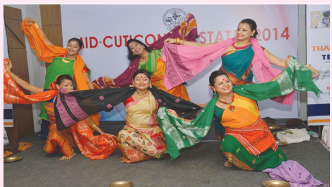
Cultural program during Mid Cuticon 2014 (North East)