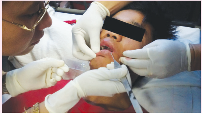
Manipur –Vitiligo Day –Surgeries were performed