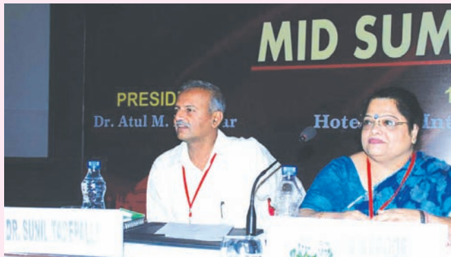
IADVL SIG Genodermatoses held its session at MID CUTICON Delhi