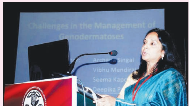
IADVL SIG Genodermatoses held its session at MID CUTICON IADVL Dili