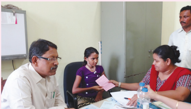
Monthly Clinical Meetings : West Bengal