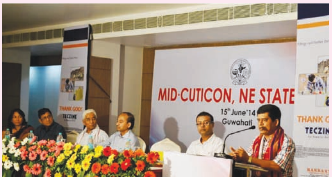
Inugural function of Mid Cuticon 2014 North East