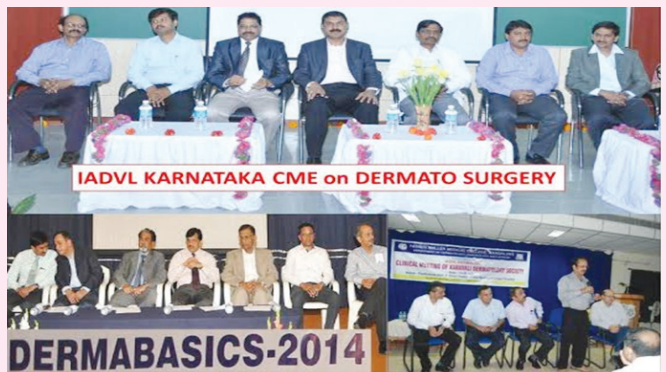
IADVL Karnataka Scientific Activities