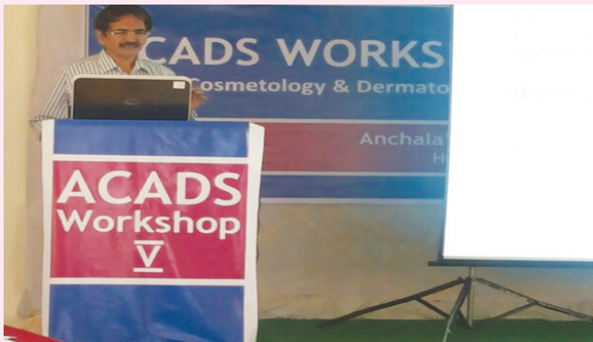
Andhra Pradesh Workshop on mesotherapy