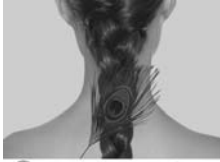
IADVL - L'ORÉAL INDIAN HAIR & SKIN RESEARCH GRANT