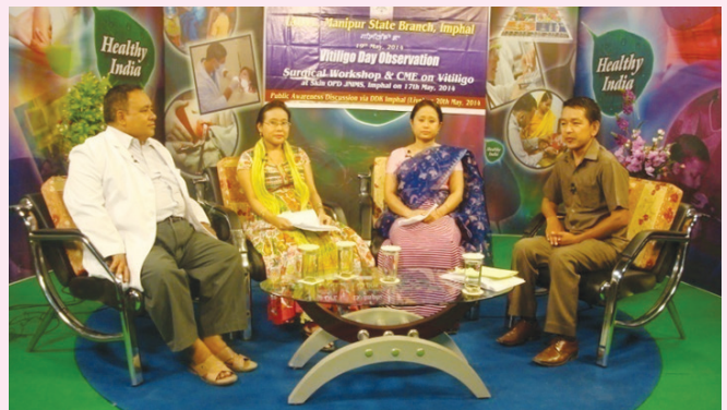
Manipur Doordarshan Discussion 1