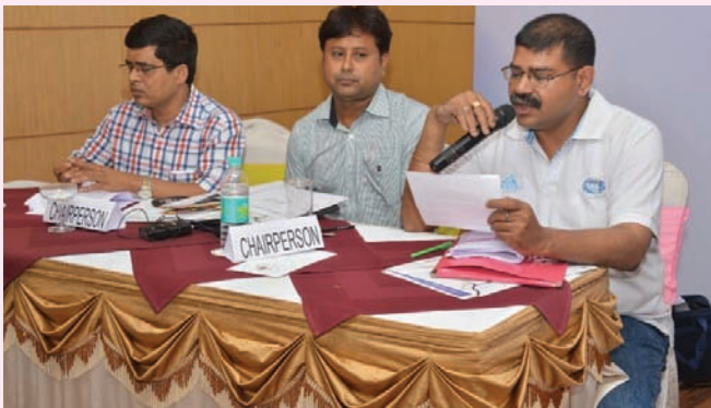
GBM of Mid Cuticon2014 (President,Treasure and secretary from left) (1) (North East)