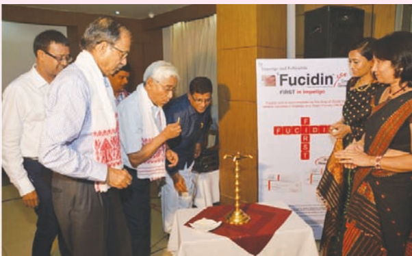
Lightning of lamp in the Mid Cuticon 2014 by our seniors North East