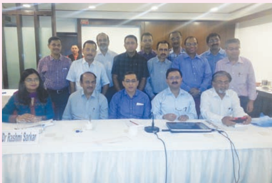
IADVL Academy meeting, 4th May 2014, New Delhi