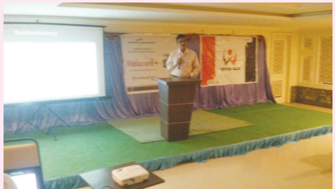
Andhra Pradesh -CME on Melasma