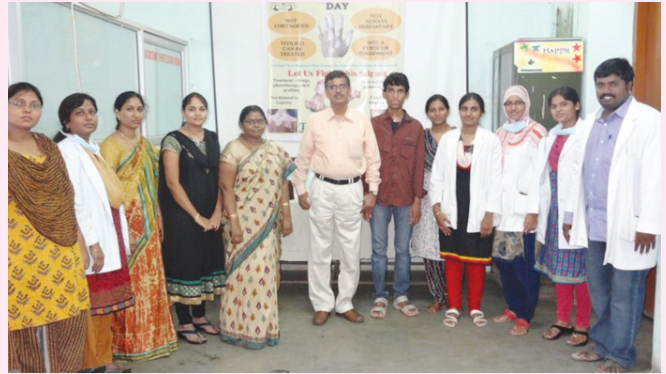
Vitiligo Day Andhra Pradesh