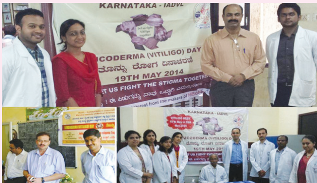
IADVL Karnataka Vitiligo Day: 19th May 2014