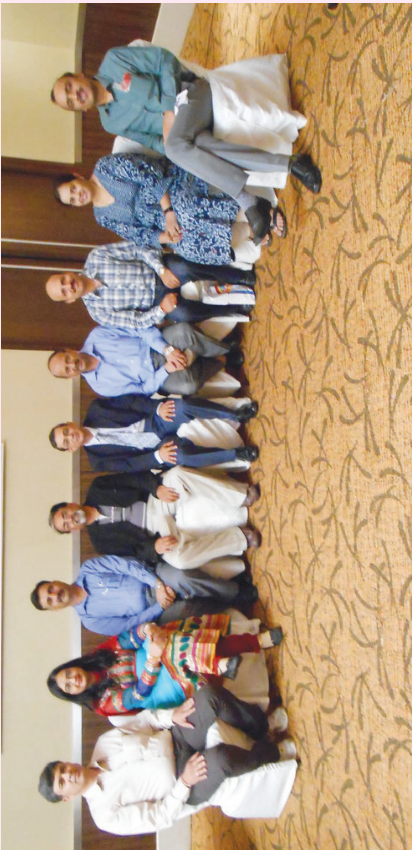
IADVIL EC Meeting 2014, 12-13 April ,Mumbai