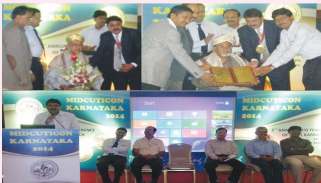
Midcuticon Karnataka 2014, Mysore