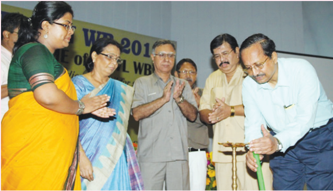
Mid-Cuticon WB 2014