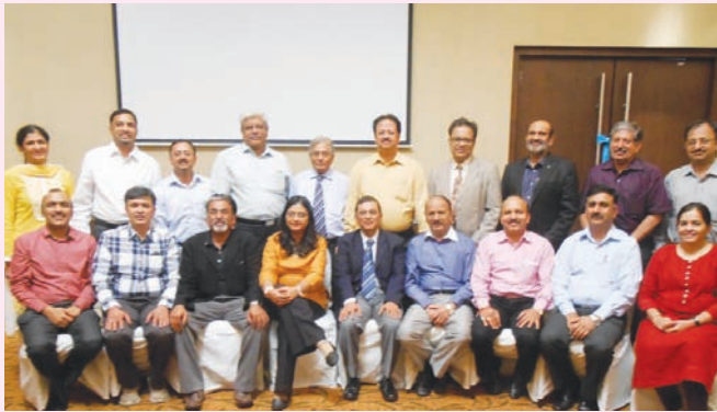
IADVL EC meeting 2014, 12-13 April 2014, Mumbai