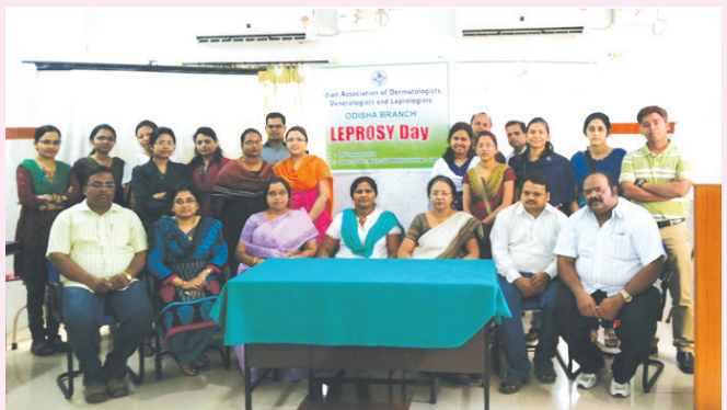
IADVL Leprosy day observation in department of skin & VD, SCB medical college, Cuttack (Odissa)