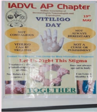
Vitiligo Day Andhra Pradesh