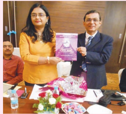
Symbolic release of IADVL April 2014 e- Newsletter at IADVL EC meeting