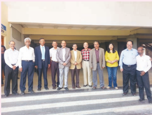
Venue Inspection for SARAD 2015 at Mysore