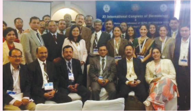
IADVL Academy Meeting at XIth ICD-42nd DERMACON 2014, New Delhi-5.12.2013