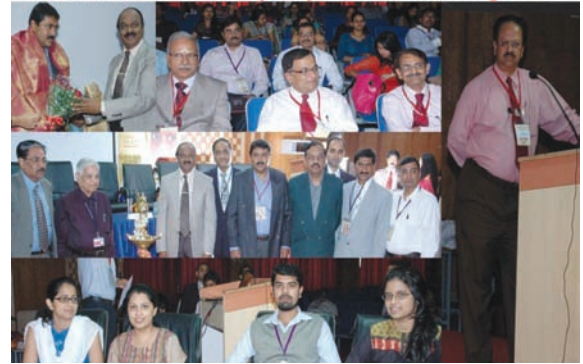
State Level CME on Leprosy, RRMCC & H, Bangalore

Department of Dermatology, Father Muller Medical College Hospital: observed Anti Leprosy fortnight from 30th Jan to 13th Feb 2014. On this occasion, a skin camp was organised.