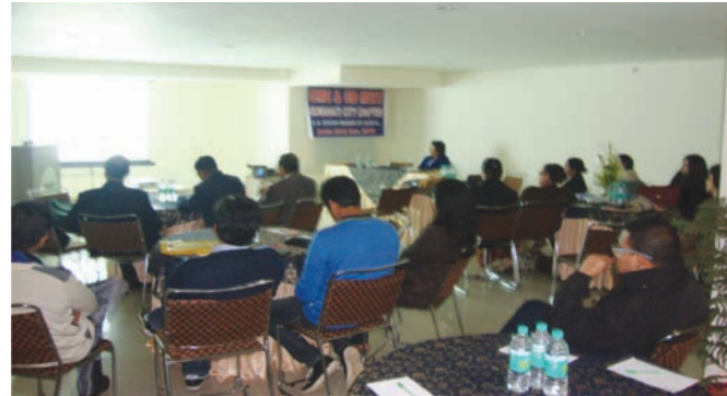
CME at Guwahati City Chapter