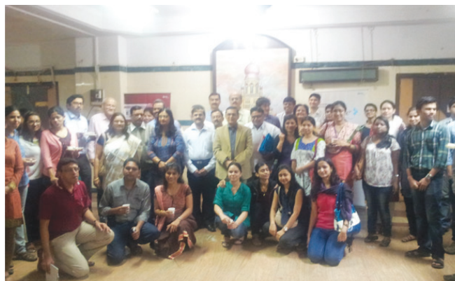
Faculty and Delegates at IADVL Research Methodology Workshop, Mumbai