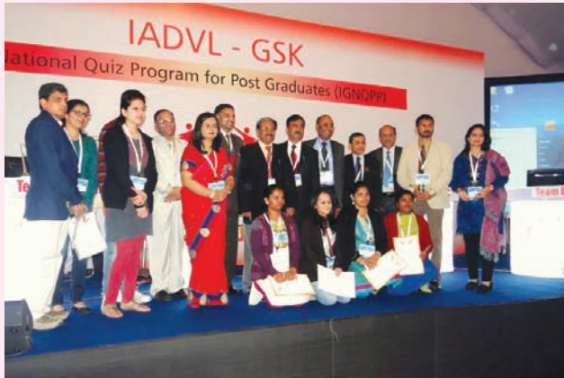
IADVL GSK Quiz winners, faculty and National Executive 2014, New Delhi-5.12.2014