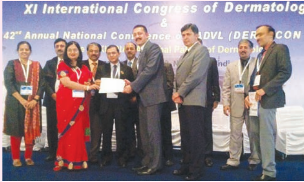
IADVL Felicitation Day-5.12.2013