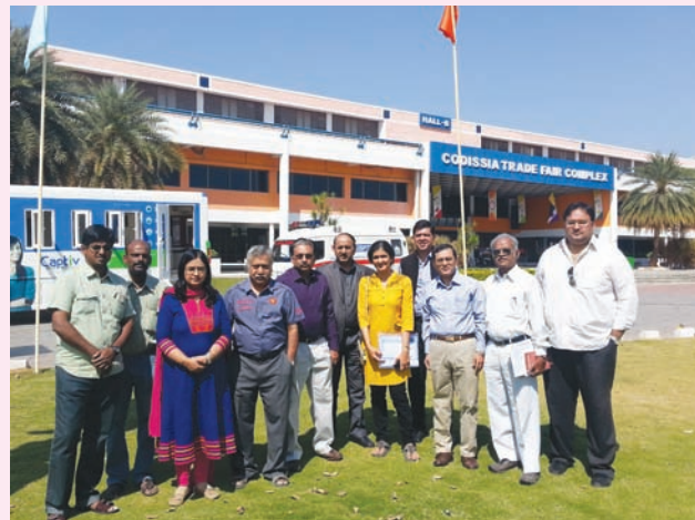
Venue Inspection for DERMACON 2015 at Coimbatore