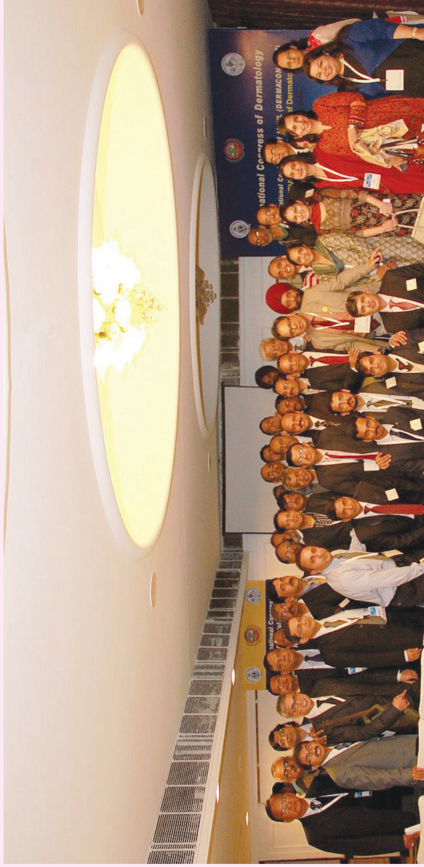
ACAD IADVL Meeting at Xth ICD-42nd DERMACON