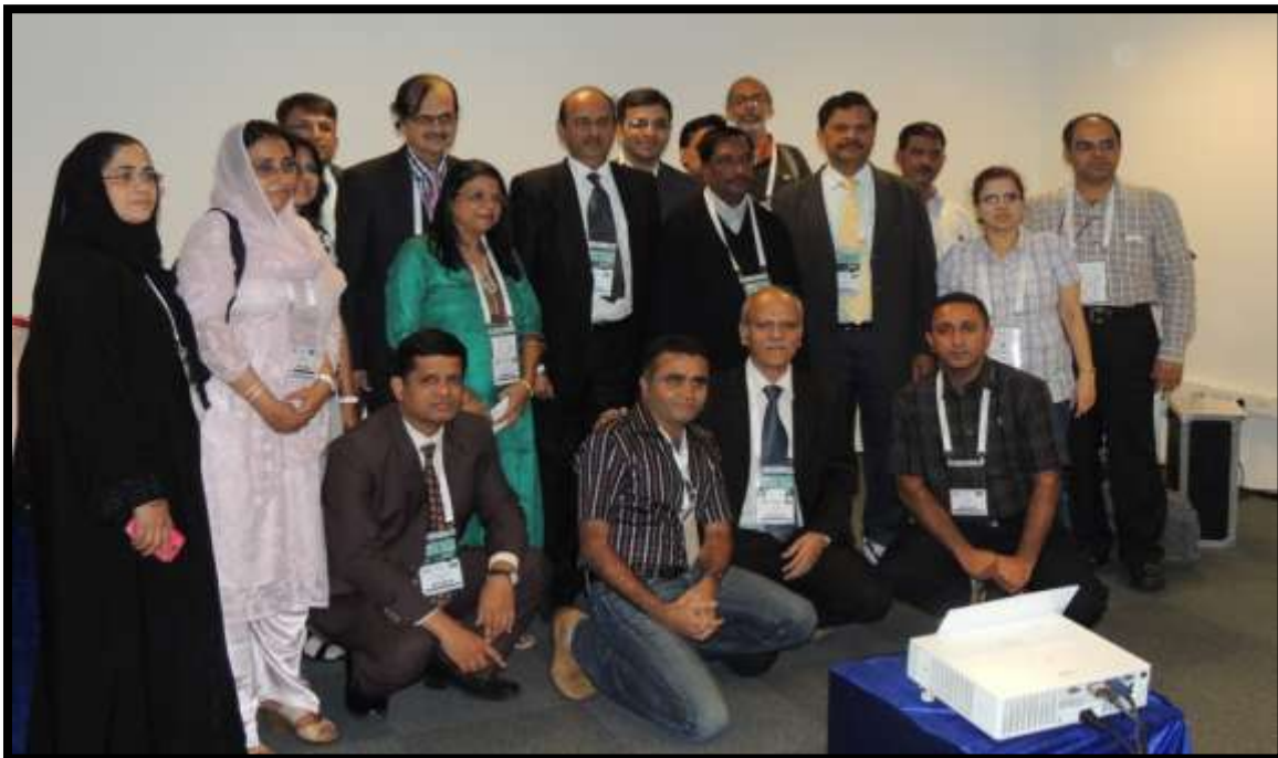
Our members at IADVL sister society meet held on 2 nd – 6 th October, 2013, EADV Istanbul 2013