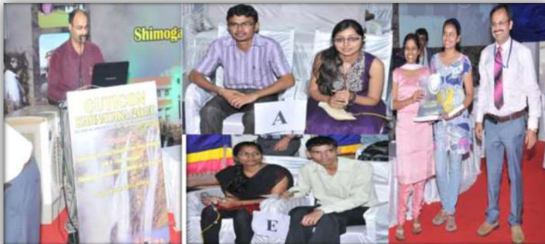
IADVL KN UG Dermatology quiz, Finals; CUTICON KN 2013, Shimoga