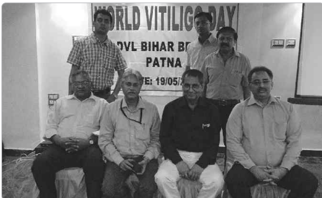
▲ Bihar State Branch