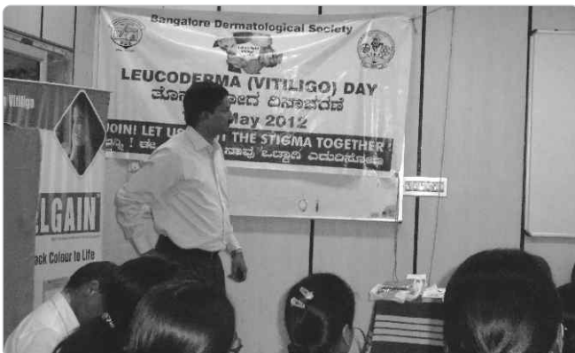
▲ Karnataka State Branch