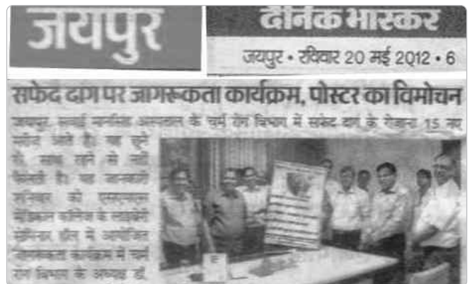
▲ Rajasthan State Branch