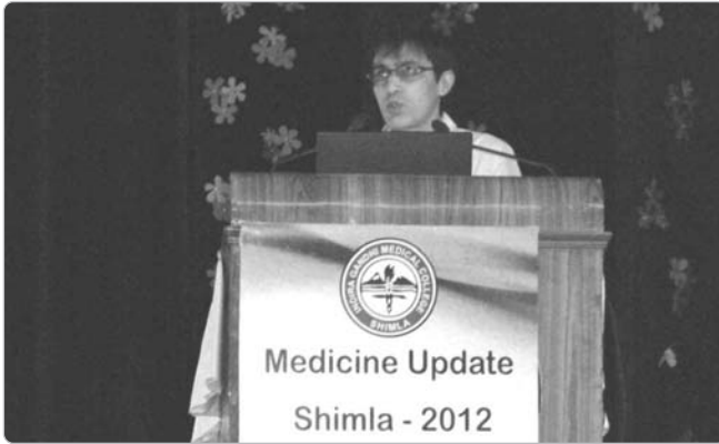
▲ Punjab State Branch