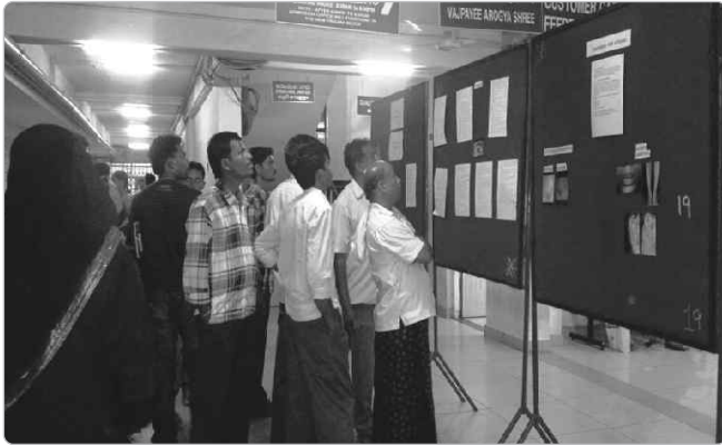
▲ Manipur State Branch