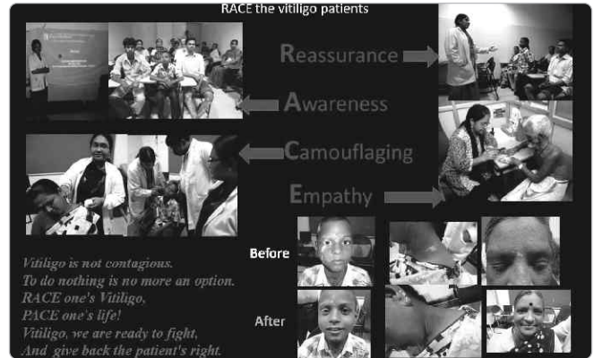
▲ Tamilnadu State Branch