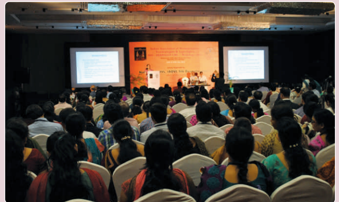
▲ Attentive audience of Dermato-surgery workshop in MID DERMACON on 15th July 2012