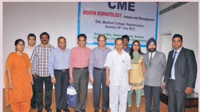
▲ Organizing committee of GSL medical college with Faculty