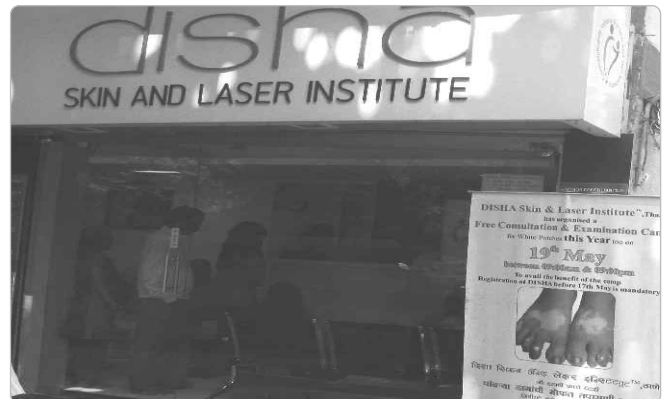
▲ Maharashtra State Branch