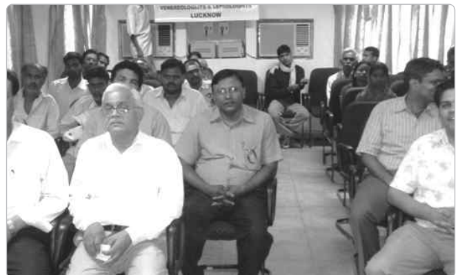
▲ Uttar Pradesh State Branch