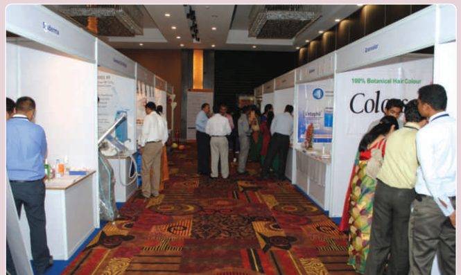
▲ Exhibition Stalls at MID DERMACON