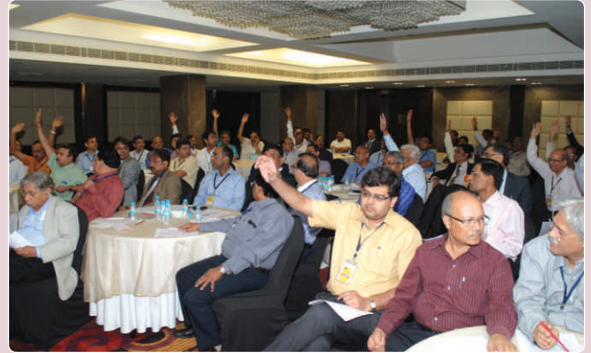
▲ CC members actively participating in the Central Council meeting in Crystal hall On 14th July 2012