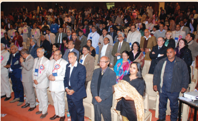
◀ ▲ 3, 4, 5 are pictures of DERMACON 2012 40th edition of the National Conference of IADVL was held between February 8th to 12th, 2012 in the vibrant pink city, Jaipur