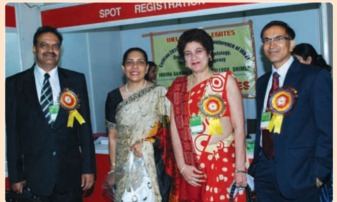
▲ Punjab, Chandigarh, Himachal State Activity 37th Annual Conference of IADVL 'CUTICON' 2011 on 8th & 9th October, 2011 at Shimla