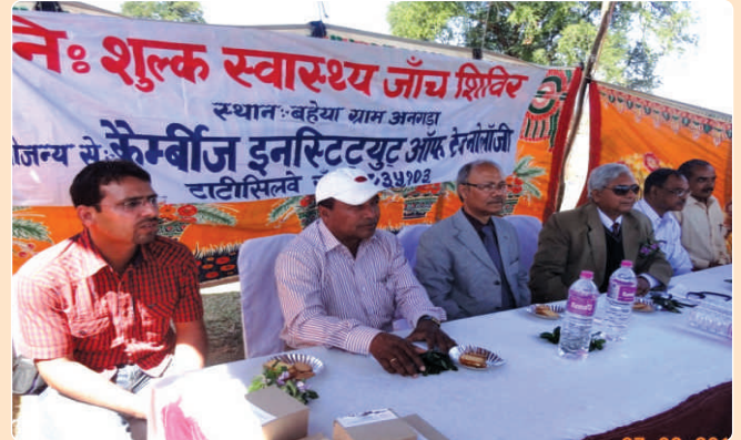
▲ A Free Medical Camp was organised on 27th February 2012 in the village 'Boheya'