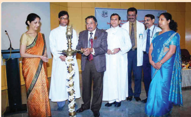
▲ SIG Dermatological Nursing Care: First Zonal Workshop on 7th & 8th January 2012 at Mangalore