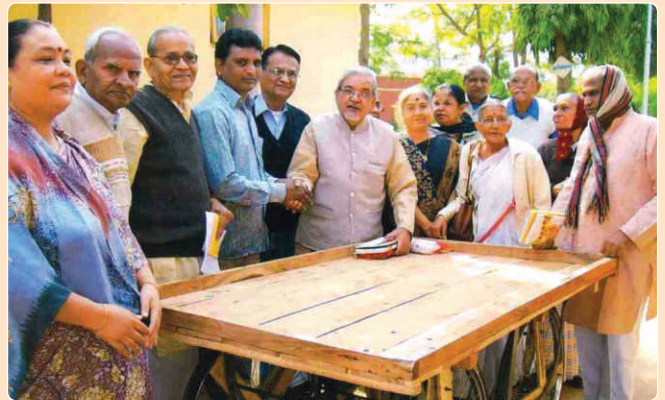
▲ 4 & 5 pictures of Gujarat State branch have observed Leprosy Day on 30th January, 2012