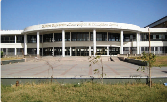
▲ Venue for DERMACON 2013 at Gujarat University Convention & Exhibition Centre