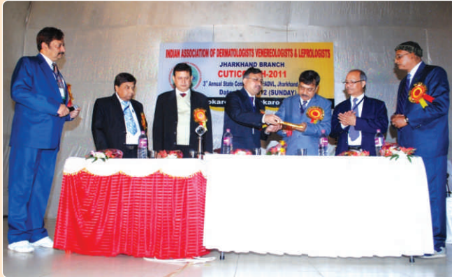
▲ 3rd Cuticon Jharkhand 2011 on 8th January 2012