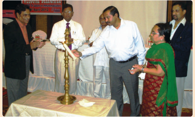
▲ 1, 2, & 3 are pictures of A.P State branch of IADVL conducted a CME on 'Update on Immunomodulators in Dermatology' for all the Dermatologist of state 8th April, 2012 (09:00.am to 03:00.pm) at Hotel Manasarovar, Chiran Fort, Begumpet, Hyderabad