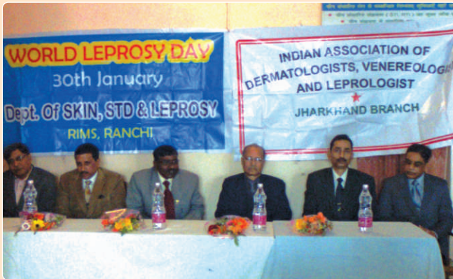
▲ Leprosy Awareness Programme was held in the skin & V.D. OPD complex of RIMS, Ranchi on 30th January 2012