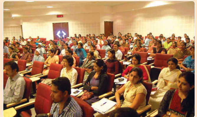
▲ IADVL GSK National Quiz Programme for Post graduates South Zone finals