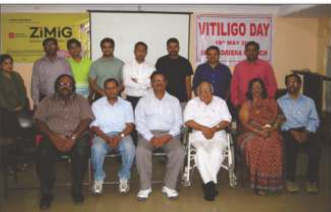
Vitiligo Day, Orissa.