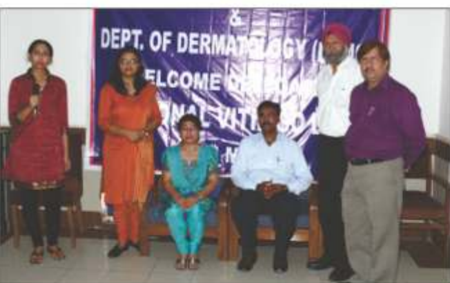
Vitiligo Day, Delhi