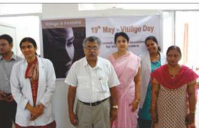
Vitiligo day Coimbatore