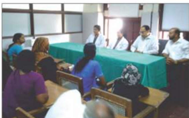
Vitiligo Day Kerala