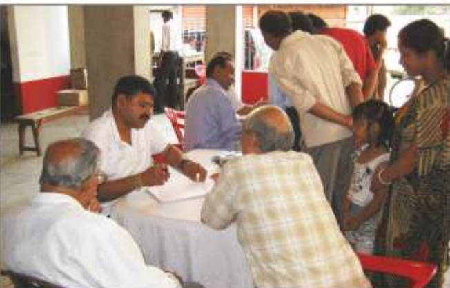
Vitiligo Day NE States