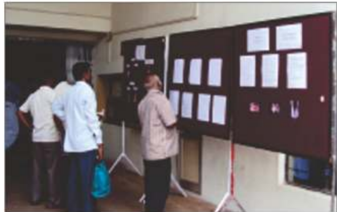
Vitiligo day, KMC, Manipal