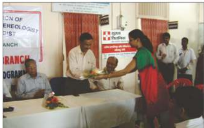
Awareness programme of Vitiligo day, Jarkhand