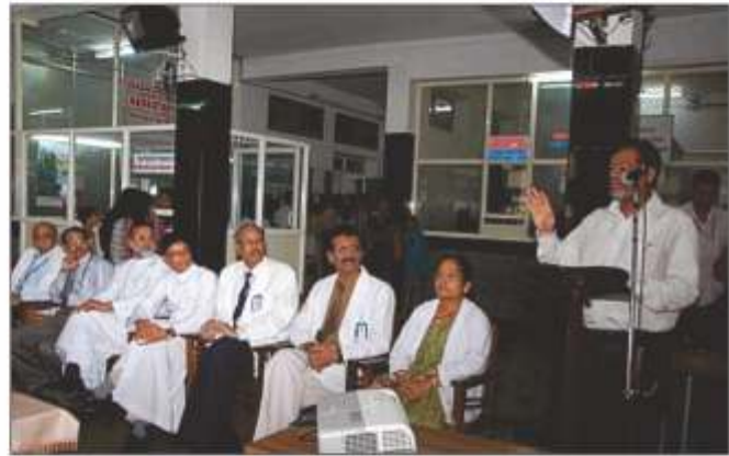
Vitiligo day, Father Muller Medical College, Mangalore.