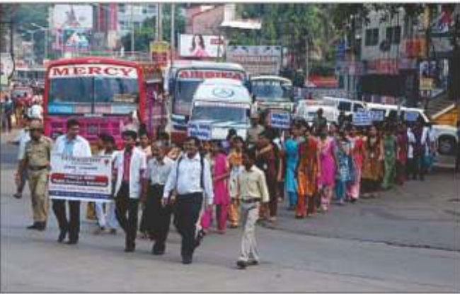
Vitiligo JATHA, Mangalore