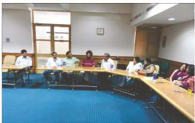
Mid Summer Meet of Haryana