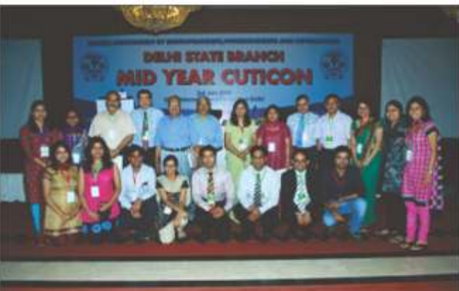
MID CUTICON, Delhi