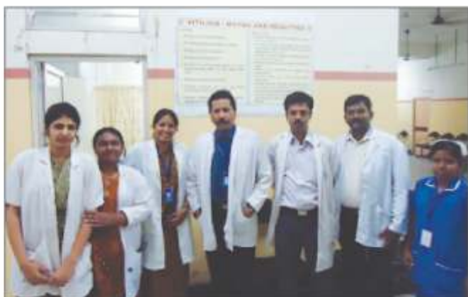
Vitiligo day Chennai