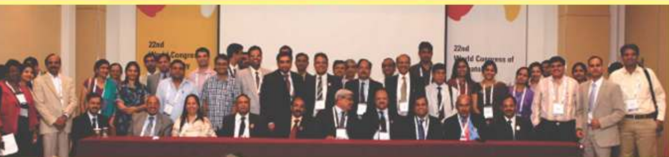
WCD Sedul - IADVL Ancillary Meeting