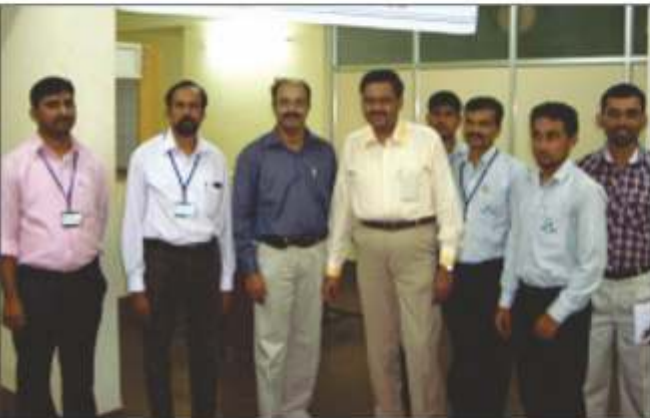
Vitiligo Day, Yenepoya College and Hospital, Mangalore